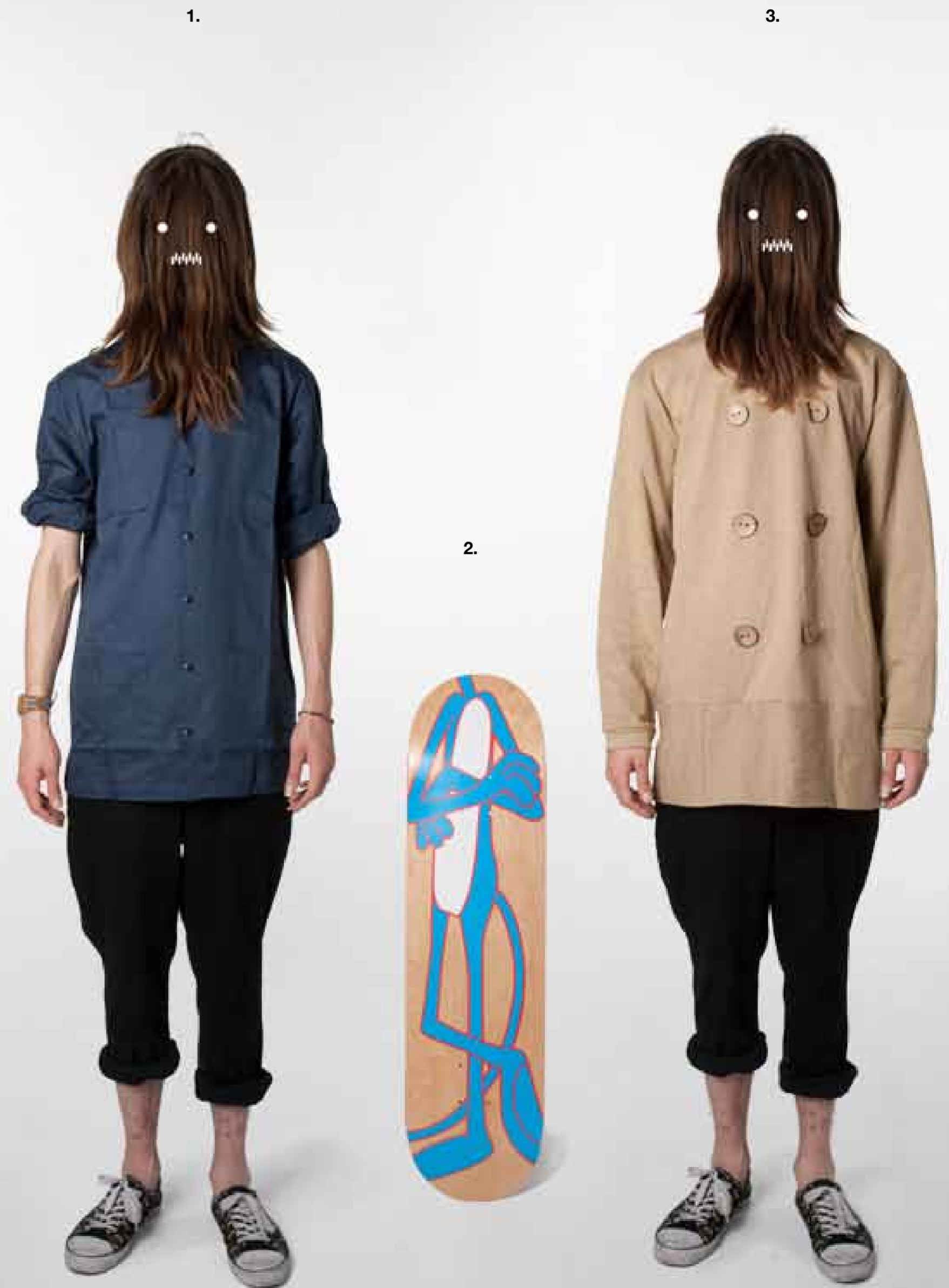
3. clouseau wood button sweater