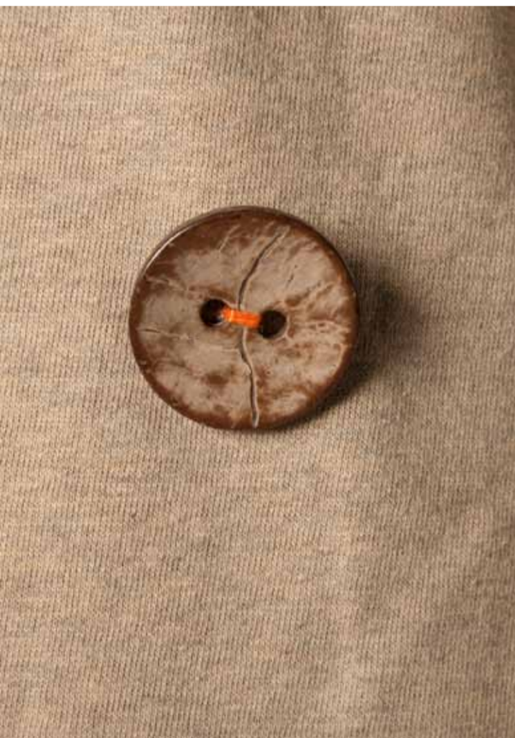
coconut shell button with orange stitching