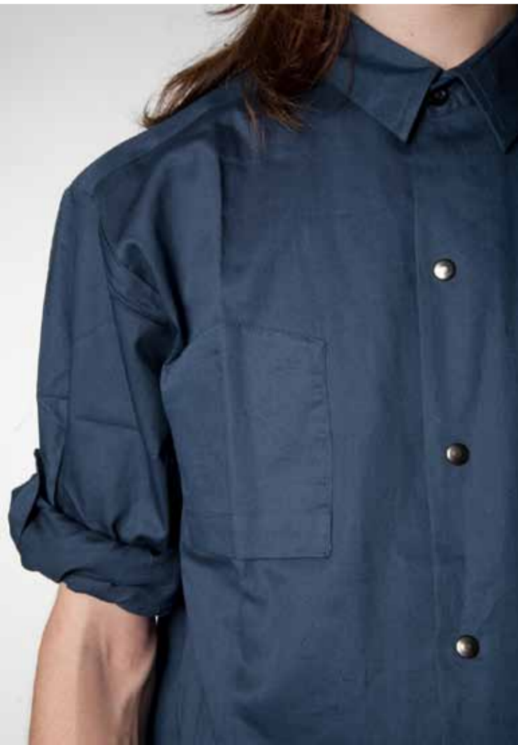
upside down right chest pocket