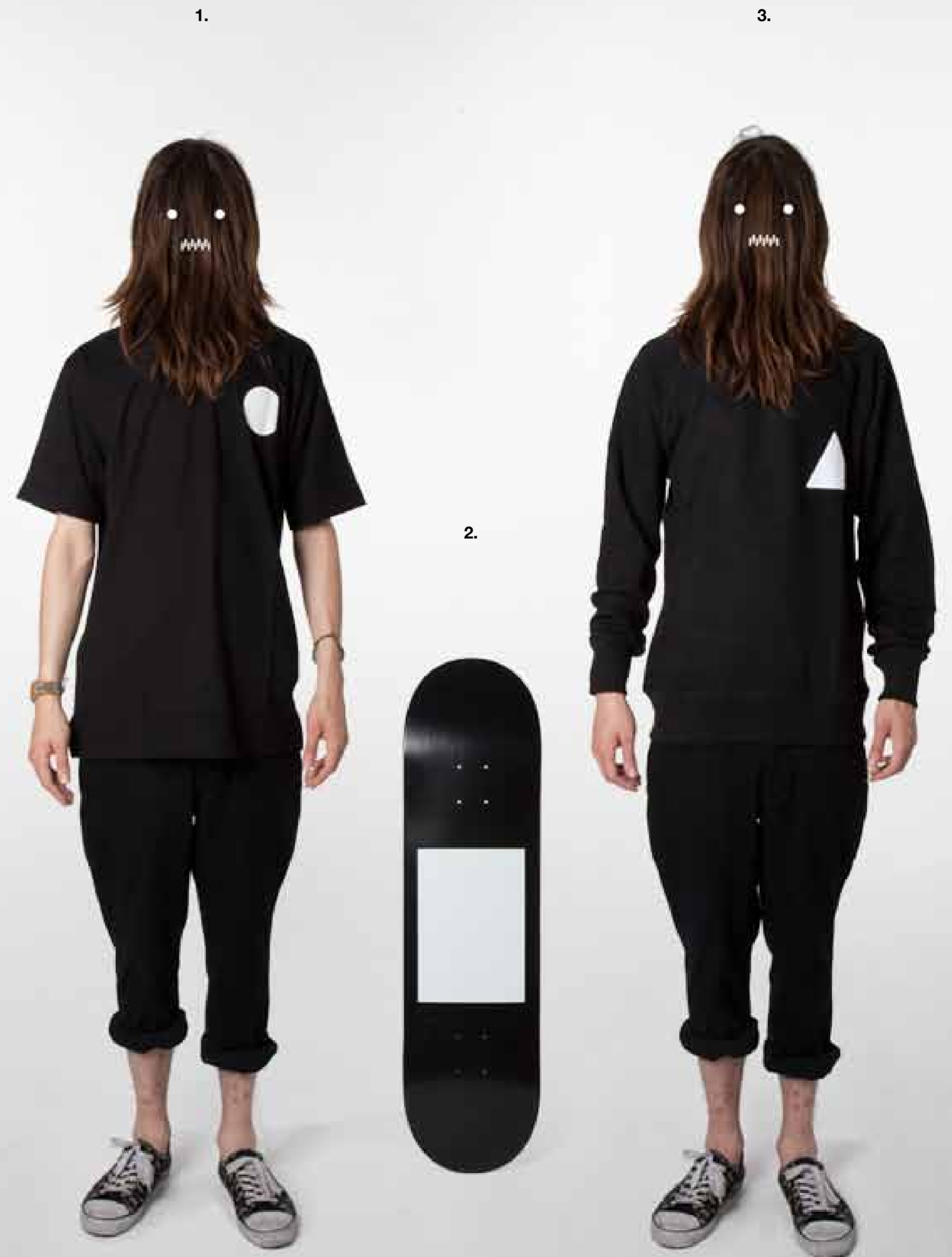
3. minimal sweater