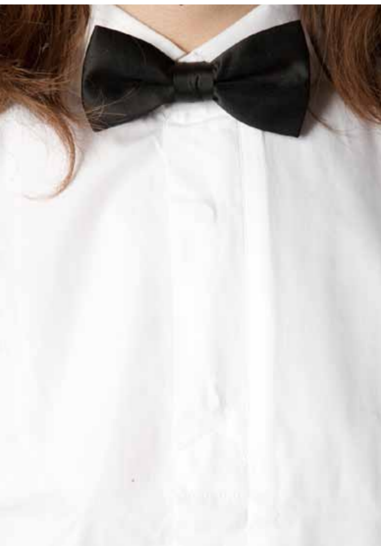
fine quality bow tie included