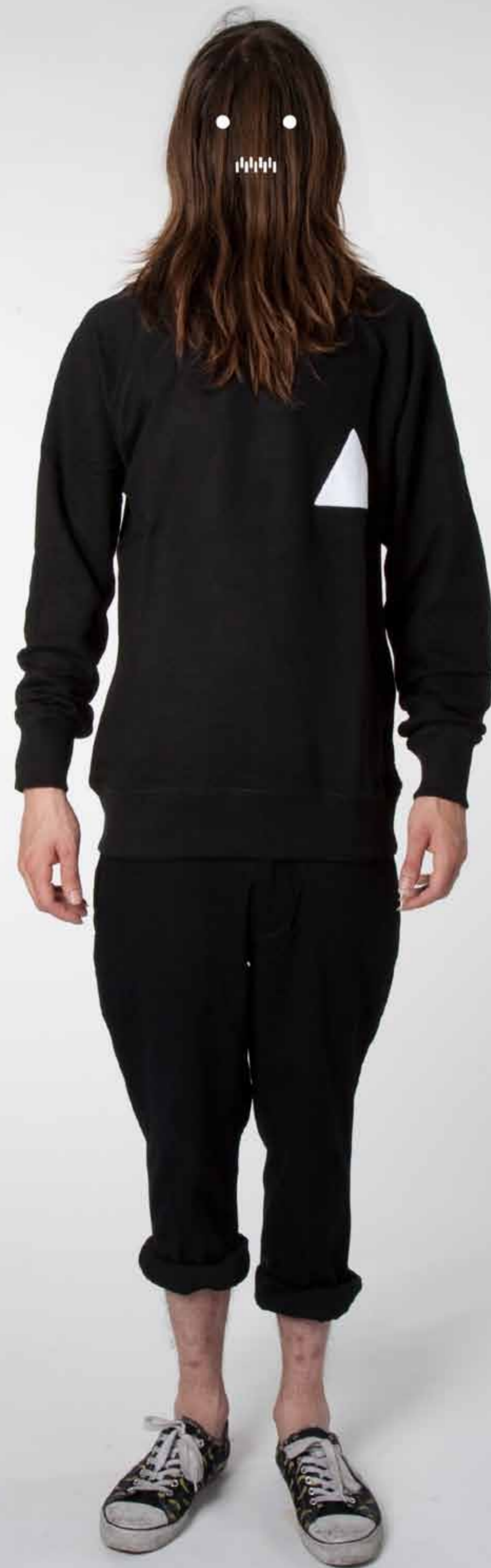
stitched on fabric triangles