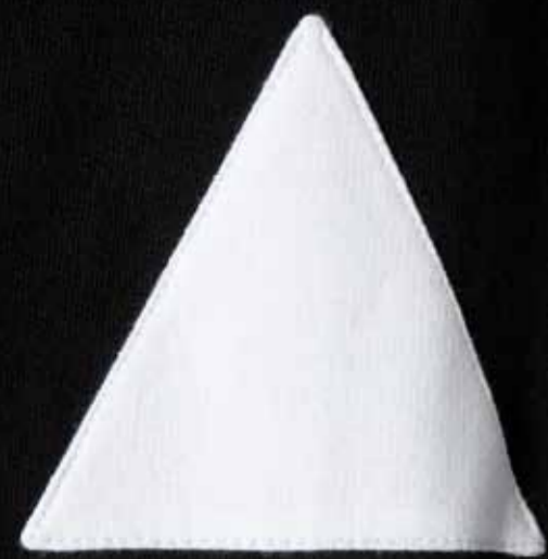
stitched on fabric triangles