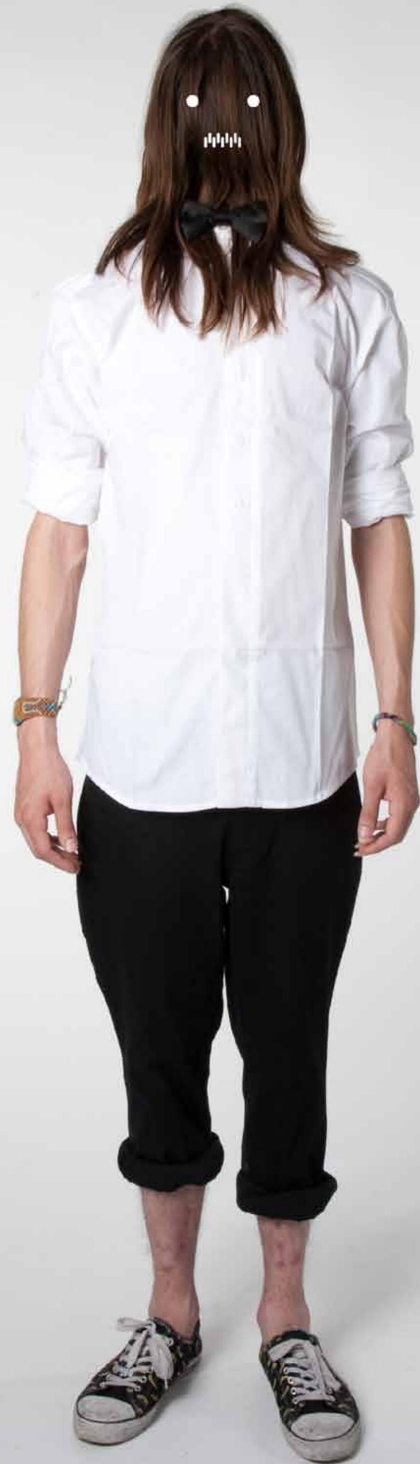
fine quality bow tie included